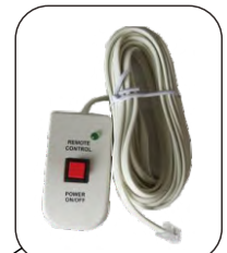
Order No.: RC-1700